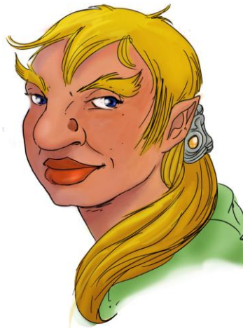
A female gnome