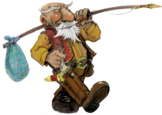
An older male gnome vagabond