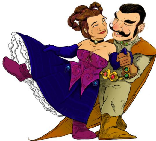
Two gnomes dancing