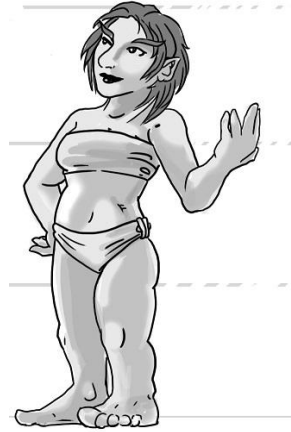
A female gnome