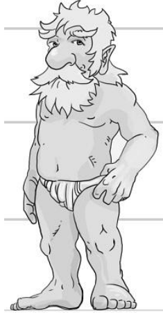
A male gnome