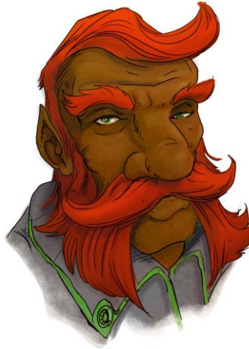
A male gnome